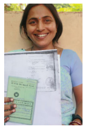
Women's World Banking, a global nonprofit dedicated to providing low-income women with access to financial tools and resources, launched a knowledge network.

ConocoPhillips' collaboration platforms have